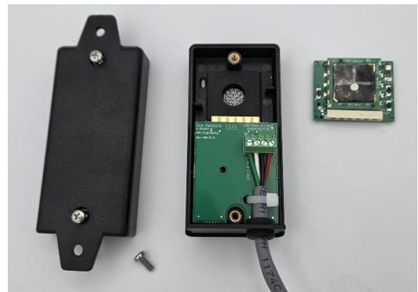
Back panel Retention screw SM-100/500 RME Sensor